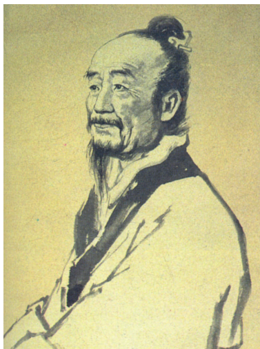
Figure 1: Liu Hui (225–295)