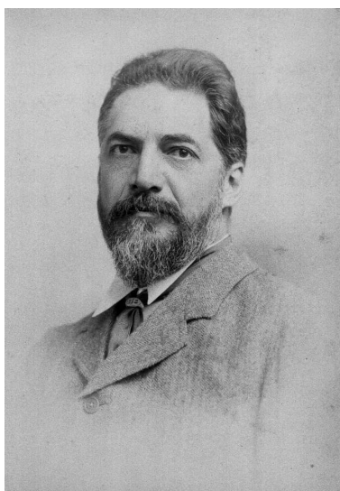
Figure 1: Sir William Matthew Flinders Petrie

British and international learned societies, Petrie remains a controversial figure due to his right-wing views on social topics and his belief in eugenics, see [19]. Upon his death, he donated his skull to the Royal College of Surgeons London, in particular, to be investigated for its high intellectual capacity in the field of mathematics, see [21].