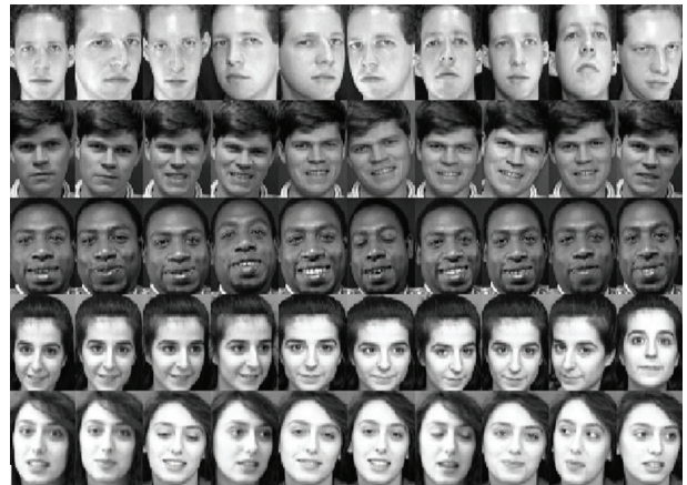
FIGURE 5: Part of the face images from the ORL database for testing.

The criterion we use for judging, whether a sample is an outlier or not, is to measure the distance between the testing sample and the selected target class. If this distance is greater than the threshold, this sample will be classified as an outlier. In T-TPTSR method, the first-phase process finds a local distribution close to the testing sample in the wide sample space by selecting M -nearest samples. In the second-phase processing of the T-TPTSR method, the testing sample