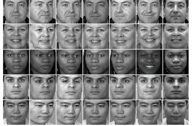
FIGURE 1: Part of the face images from the Feret database for testing.

and the value of D_{opt} is an important metric for comparing the performance of classifier for outlier rejection analysis.