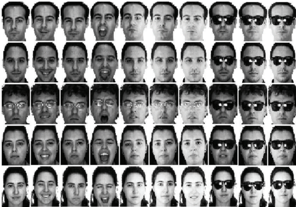
FIGURE 4: Part of the face images from the AR database for testing.