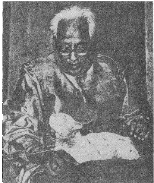
S.N. Bose with his house cat