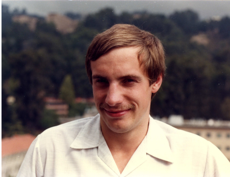
At Mathematisches Forschungsinstitut Oberwolfach 1 in 1982