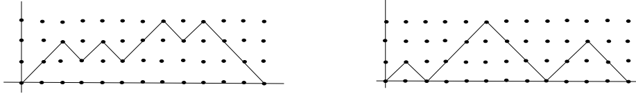
FIGURE 1. Two Dyck paths.

Chebyshev polynomials of the second kind are defined by