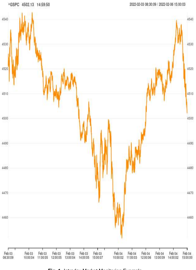
Fig. 1. Intraday Market Monitoring Example

Moreover, the 'real-time' symbol for the main market index is available only during (New York Stock Exchange) market hours. Yet sometimes one wants to gauge a market reaction or 'mood' at off-market hours.