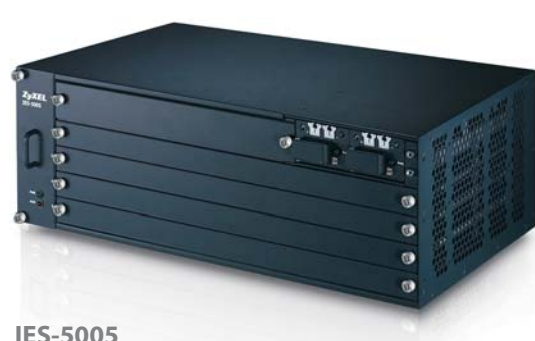
IES-5005 4U IP DSLAM with DC Power