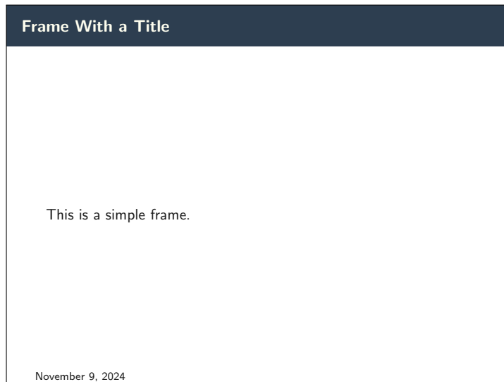
Figure 1: A simple example.