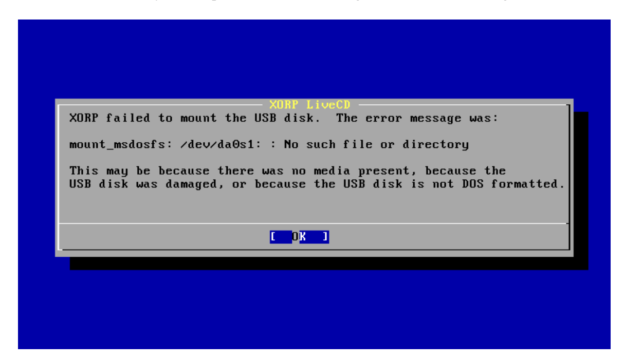
Figure 19.1: LiveCD missing configuration device warning

The startup script that runs the first time you run XORP is quite simple. If there's no USB disk connected, or it's not DOS-formatted, you'll be presented with a warning similar to the one in Figure 19.1.