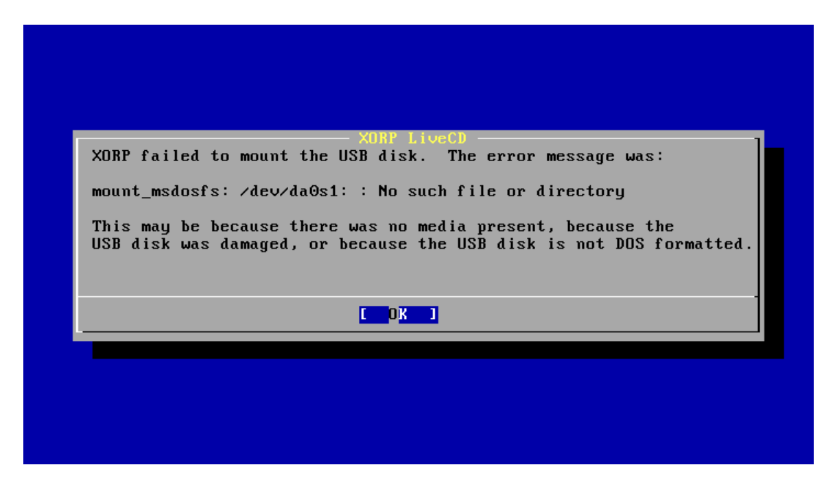
Figure 20.1: LiveCD missing configuration device warning

The startup script that runs the first time you run XORP is quite simple. If there's no USB disk connected, or it's not DOS-formatted, you'll be presented with a warning similar to the one in Figure 20.1.