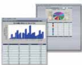
Network Reporting Analyzer